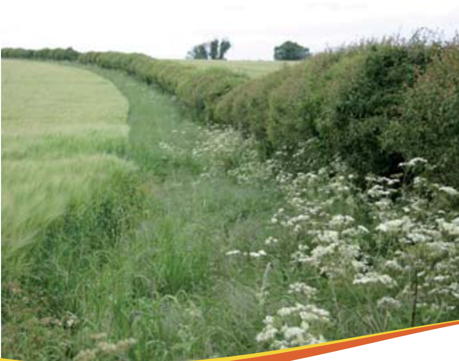
Good nesting cover

To recover the population to the 2010 BAP target (90,000 pairs in the UK) without predator control, you will need 6.9 kilometres of nesting cover per square kilometre of farm (11 miles/square mile or seven miles/1,000 acres) to achieve this target. You also need 5% of your arable area to be managed as insect-rich brood-rearing habitat (conservation headlands, wild bird seed mixes, wild bird cover on set-aside, etc (see Fact sheet 3)). Remember to try and site your nesting cover close to some insect-rich brood-rearing cover to maximise the benefits from both.