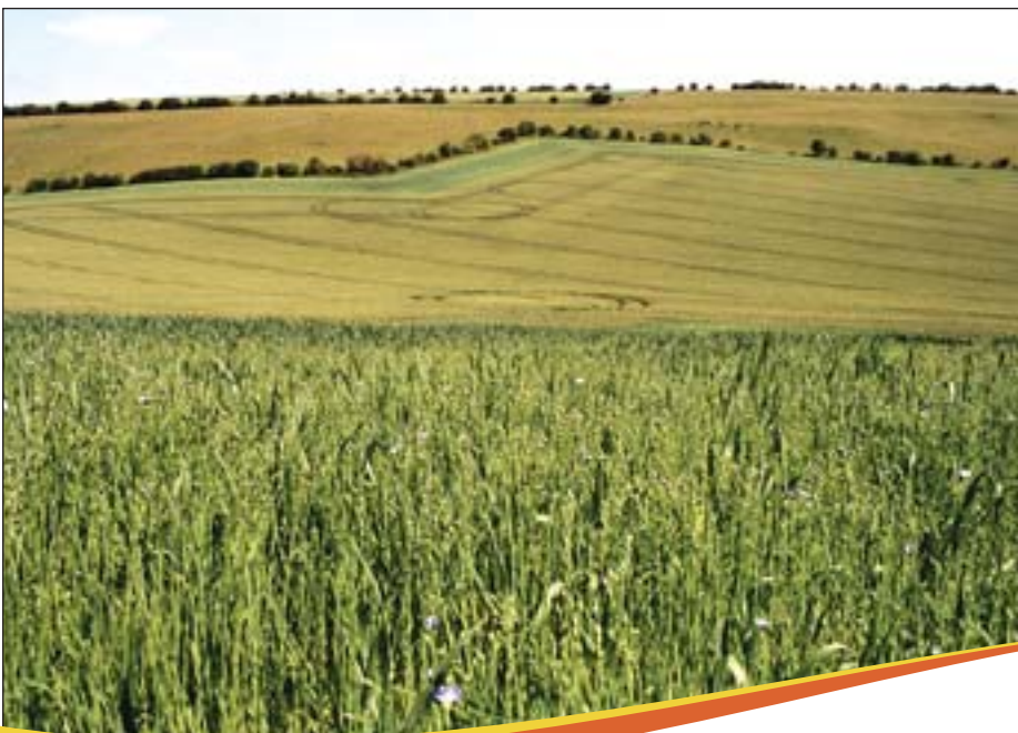
Good brood-rearing cover for grey partridges.

Cold, wet weather after hatching also leads to lower levels of chick survival and small brood sizes. Again, insect-rich brood covers can mean that when the weather improves, a plentiful supply of food is readily available and the effects of bad weather on chick survival can be minimised. We cannot control poor British summer weather, but we can provide chicks with the best chances of survival by providing abundant food in easy reach.