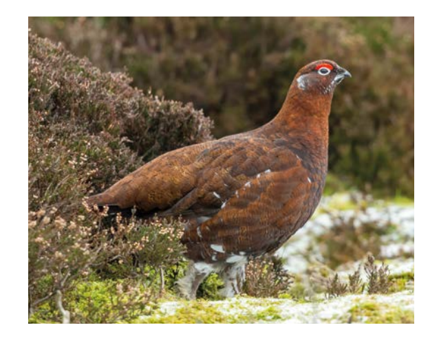
Grouse Health & Disease

With the recent significant changes to tunnel trapping legislation throughout the UK, this course keeps trappers fully up to date with both legal and humane control issues. The session addresses the legal aspects of the various methods of stoat, weasel and rodent control employed by keepers and wildlife managers, as well as the equipment required and best practice advice.