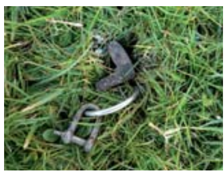
Angle iron anchor stake in position.

as on moorland. We do not recommend the use of smooth metal rods – these can easily be pulled out, especially when the ground is wet. Whatever type of anchor you use, the top of it should be more or less flush with ground level, to prevent