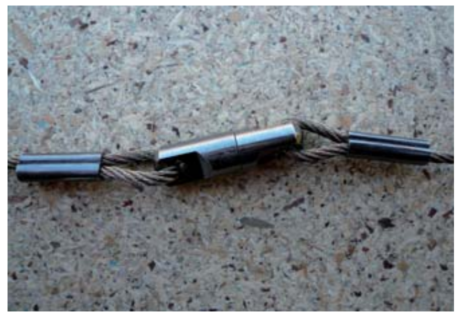
A quality mid-point swivel: small, strong and rotates easily under strain.

We like neat, small swivels: a bulky mid-point swivel spoils the natural line of the snares and makes an obvious and ugly visual distraction. However, experience