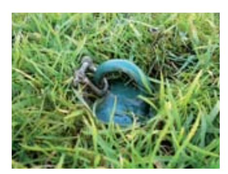
Corkscrew anchor in position.

the captive winding the snare around it. Do not attach snares to posts or natural objects such as trees or saplings – this encourages entanglement which may result in injury or death.