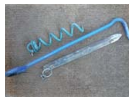
Two kinds of anchor: angle iron stake (below) and corkscrew (above). The man-hole cover lifter (centre) makes an excellent extraction tool for both anchors.

Anchor: The snare anchor must be effective at holding not only a fox, but any non-target animal that might be caught. There is no single anchor type that will suit all ground conditions. For the majority of conditions, we recommend a 450mm \times 25mm length (18'' \times 1'') of 5mm thick angle-iron, driven into the ground. An 8mm hole should be drilled 50mm from the top, in the middle of one side of the angle iron. Connect a 50mm diameter welded ring to a D-shackle, and fix the shackle to the stake via the drilled hole. The snare should be attached to the ring, with another D-shackle. This arrangement acts almost like a universal joint and is unlikely to foul the anchor. Whenever you use D-shackles, make sure they are tightened using pliers.