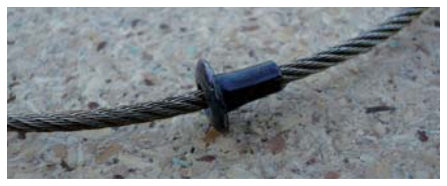
One kind of fixed stop, which prevents the noose closing too far.

Tealer: The snare needs some kind of support. It is usually supported by a rigid stick or wire 'tealer' at one side of the run on which it is placed. The 'old school' approach uses a short stick of hazel or similar wood as a tealer, split at the top to hold the cable. This is a local natural