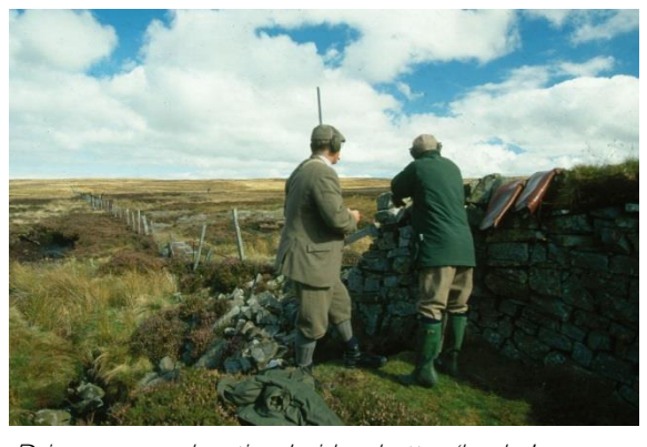
Driven grouse shooting: Inside a butt, a 'loader' prepares the guns for the person shooting (the 'gun').

A: Yes. Red grouse, pheasants and partridges are 'driven', where birds are flushed by a line of beaters and fly over the people shooting, who are stationary in a line. On grouse moors they typically stand in a line of 'butts' – screened stands for one shooter. But red grouse are also shot 'walked-up', where the participants walk across the moorland, flushing birds as they go; and 'over dogs', where walking shooters use trained pointing dogs to find grouse.