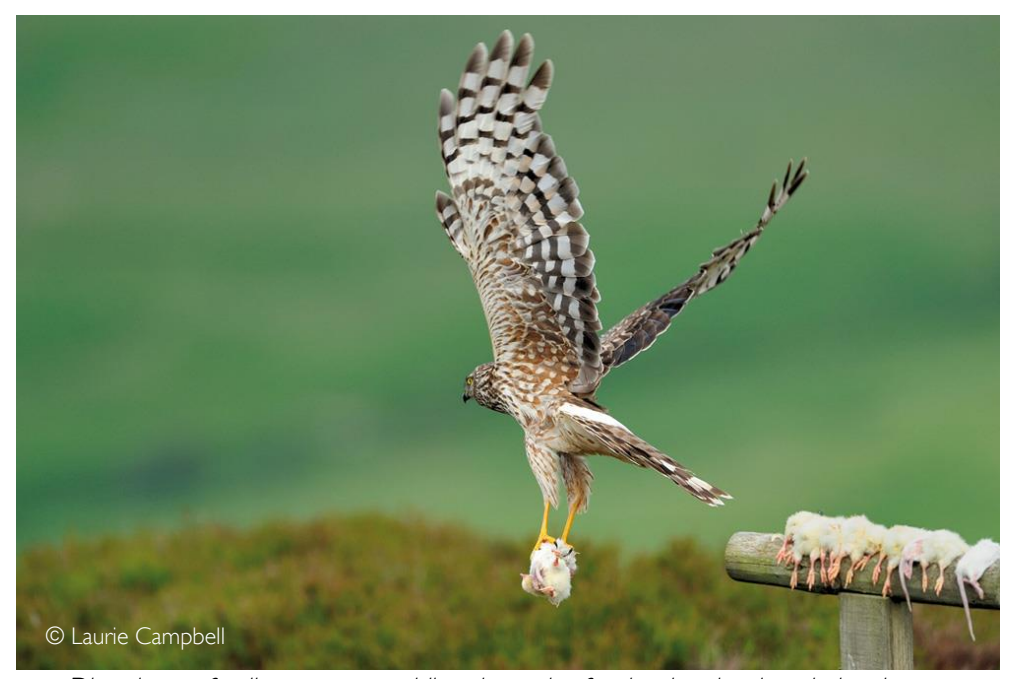
Diversionary feeding means providing alternative food to hen harriers during the two to three months when they are breeding so that they kill fewer red grouse chicks.

A: Now, after 15 years of talks, 20 reports, three governments and six years of mediated conflict resolution talks, the aim is to implement the <u>Defra Hen Harrier Action Plan</u>, published in January 2016. This plan recognises the source of the conflict, and brings together several approaches to mitigate it. The combination of diversionary feeding, brood management, winter and roost protection, reintroduction into previously occupied areas, population monitoring, and increased intelligence and prosecution efforts offers the best solution to resolve this divisive issue.