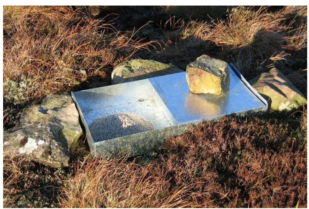
Medicated grit to control strongyle infection is provided in grit trays, which can be closed as necessary to prevent or allow access when appropriate. Use is prescribed by a veterinarian.

A: No. Use is regulated and it is only provided when the birds need it, when prescribed by a vet. Typically demonstrating need involves the moor collecting sample worm burden data from grouse to test for worm numbers.