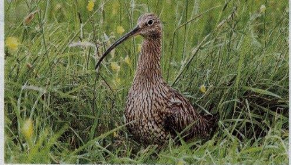
We are lucky to have curlew nesting on our farm.

Upper Nidderdale Facilitated group. This is a group of farmers, from Bewerley up to Scar House Reservoir, who have