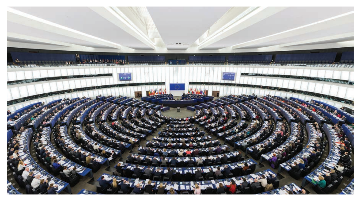
Much of the environmental protection legislation in the UK derives from EU directives.

Financial support for farming outside CAP will not have the same structure as we recognise now. Many farms across the UK are viable only because of the payments that are received in return for adhering to good farming practices. In future, financial support for the act of farming itself is unlikely, however the GWCT suggests that this money be kept in the countryside and made available to farmers still, through environmental support. This document explains current UK farming structure, a brief summary of how we got here, and our vision for a future containing profitable farms, a healthy environment and thriving wildlife.